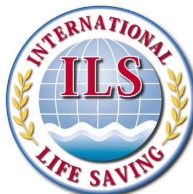
Logo in layers